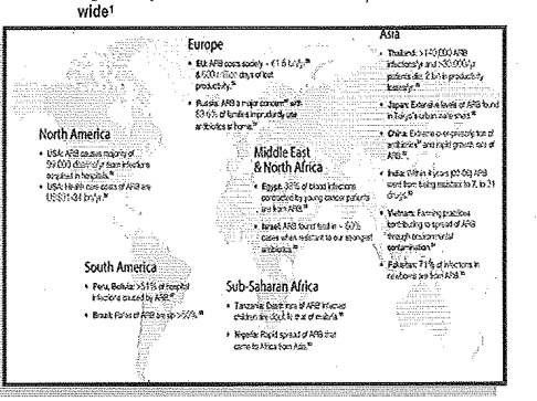
Figure 1. Spread of antibiotic resistant bacteria world-

The oppartment of Pandemic and Epidemic Diseases (PED) develops strategies, initia-tives, and mechanisms to address priority emerging and re-emerging epidemic dis-eases, including outbreaks, thereby reducing their impact on affected populations and limiting their international spread.